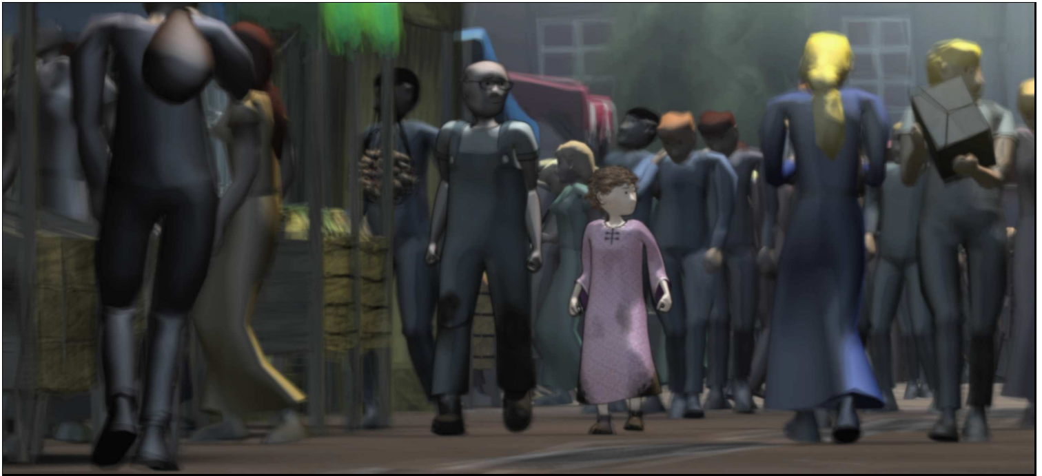
Bridgeland market was always bustling with activity back in the old days, being so close to the Metadox Capital, Karst . On clear days you could even see Metadox Tower looming ever present in the distance, A symbol of the new peaceful and prosperous age.